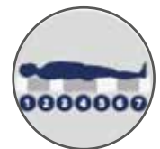
7 VARIABLE SUPPORT ZONES