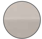
FIRMER FOAM SIDE