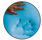
1 SIDE COOL MEMORY GEL