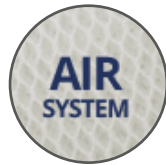
AIR SYSTEM FABRIC