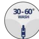
REMOVABLE WASHABLE 30-60°C