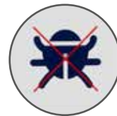
DUSTMITE RESISTANT HYPOALLERGENIC FIBRE