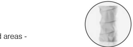
800 INDEPENDENT SPRINGS