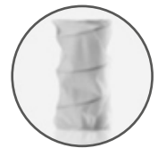
800 INDEPENDENT SPRINGS