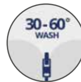
REMOVABLE WASHABLE 30-60°C