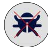
DUSTMITE RESISTANT HYPOALLERGENIC FIBRE